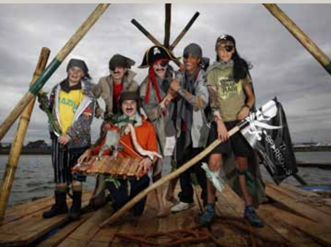
Winners of this year's Hastings Challenge Top Raft and Best Gadget Trophies

With fierce competition from other Scout groups, it was 1st Hillcrest who after hours of hard work and careful attention to detail were announced overall winners of this year's Hastings Challenge and awarded the Top Raft and Best Gadget Trophies, making it three consecutive wins in the last three years for them.